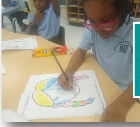
French Immersion Student drawing and having fun in her class